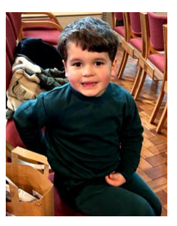
Look out for more information on our All Saints, Rayne Facebook page.