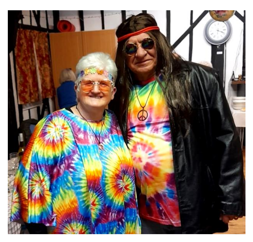
Who are these Cool Dudes from the 60's era? See page 12 for some more fun pics.