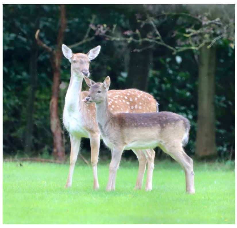
A Fallow deer with her fawn as seen in Rayne recently. See pages 20—22 for the full report.