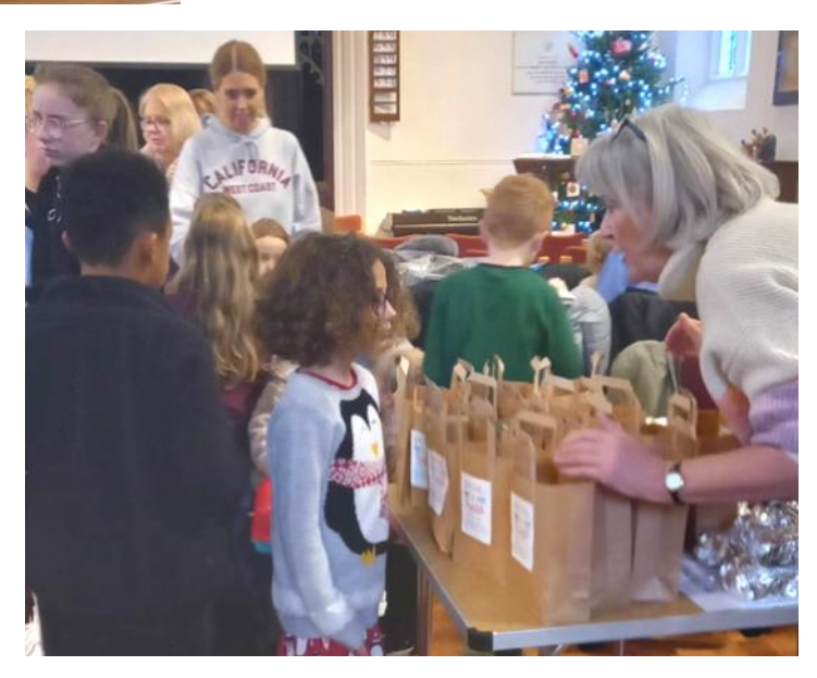
If you want to join us look out for the next event!

We hope you enjoyed it as much as we did.